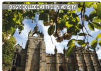
KING'S COLLEGE AT THE UNIVERSITY

For the low-down on what's happening on campus, students tune into their own radio station or leaf through their free weekly newspaper, Gaudie . As well as being full of the latest gossip and student news, it's also packed with pub and club reviews and info about the university's 58 sports clubs (p24) and 80 societies (p23).