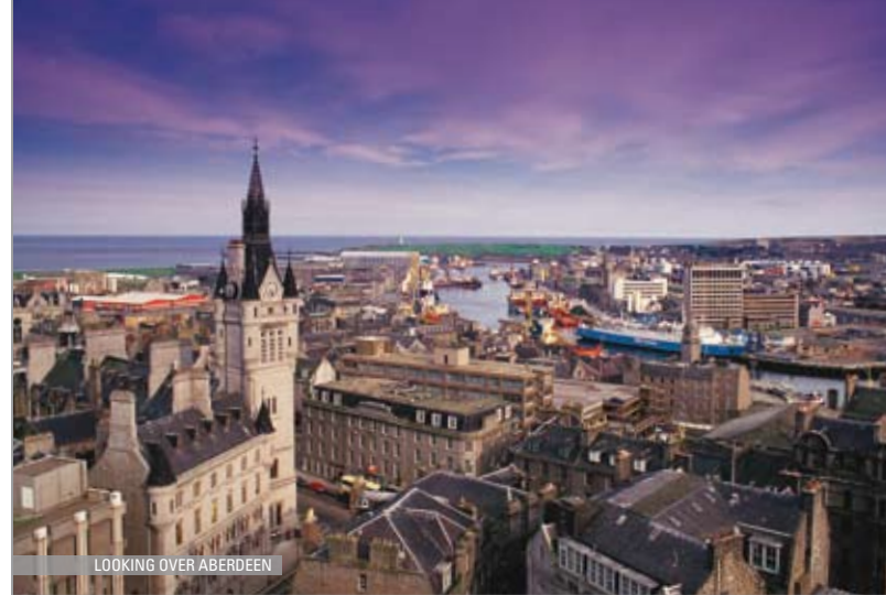
LOOKING OVER ABERDEEN

As the University of Aberdeen boomed so did the city. In the decades after the discovery of North Sea oil in the 1950s, Aberdeen became the hub of the UK's off-shore oil industry, and is dubbed Europe's energy capital. The port is still packed with brightly coloured oil-platform supply ships, record cargos are being handled and the prosperity feeds through to the