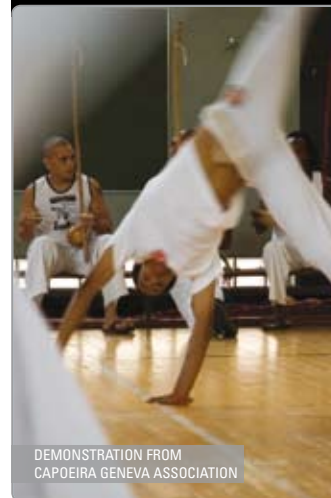
DEMONSTRATION FROM CAPOEIRA GENEVA ASSOCIATION