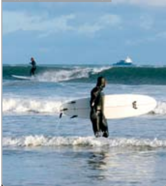
SURFERS AT ABERDEEN BEACH