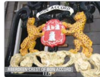
ABERDEEN CREST OF BON ACCORD

one of the most beautiful sections of Scotland, combine to make this a wonderful city to study in. Adventure, excitement, history and culture – what more could you want from a place to study?