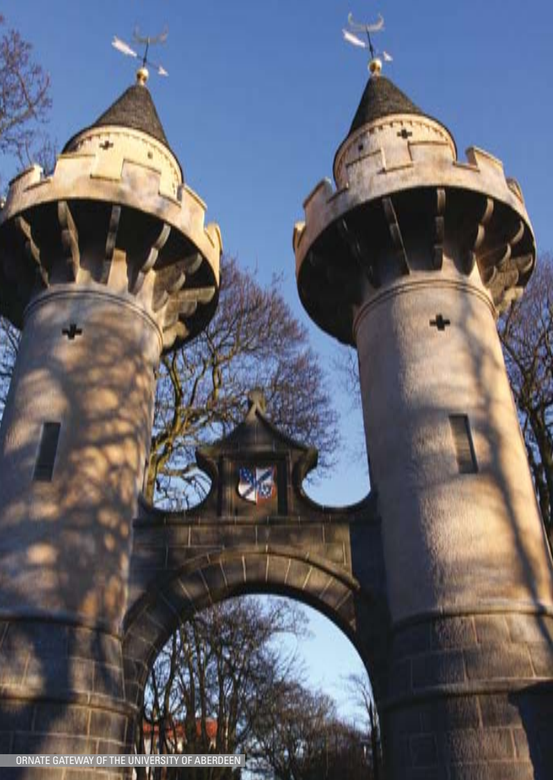
ORNATE GATEWAY OF THE UNIVERSITY OF ABERDEEN