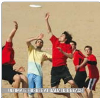
ULTIMATE FRISBEE AT BALMEDIE BEACH

and squash. In total, 58 sport clubs cater for all standards, so if you've never played before you're as welcome as an experienced athlete. Sports Blues are awarded, while scholarship schemes support up to 20 students who compete at near-national level.