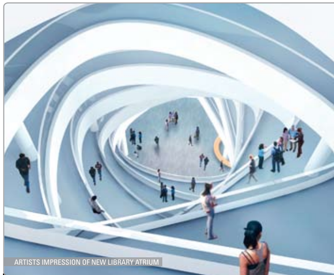
ARTISTS IMPRESSION OF NEW LIBRARY ATRIUM