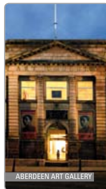
ABERDEEN ART GALLERY

Aviemore, the Cairngorm Mountain, Glenshee and the Lecht provide perfect pistes for board-riders and alpine skiers; the university's Ski and Snowboard Club will show you the way.