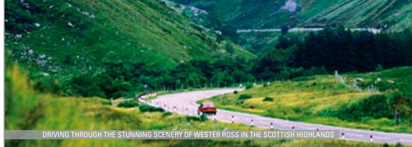
DRIVING THROUGH THE STUNNING SCENERY OF WESTER ROSS IN THE SCOTTISH HIGHLANDS