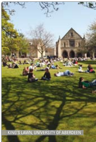
KING'S LAWN, UNIVERSITY OF ABERDEEN